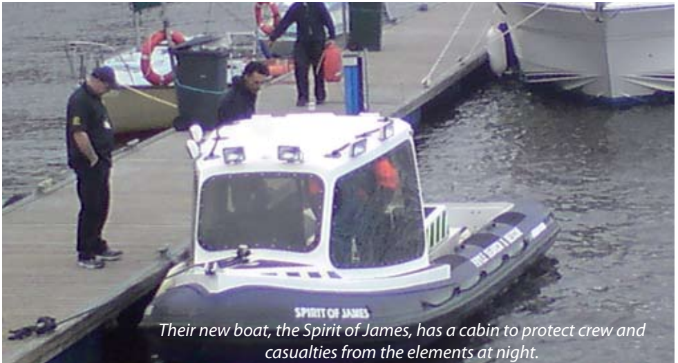
Their new boat, the Spirit of James, has a cabin to protect crew and casualties from the elements at night.

The full Foyle Search and Rescue paper, along with the Dublin Fire Brigade Water Rescue Unit paper, can be accessed free of charge at http://lifesavingfoundation.ie/pages/pro2010.pdf .